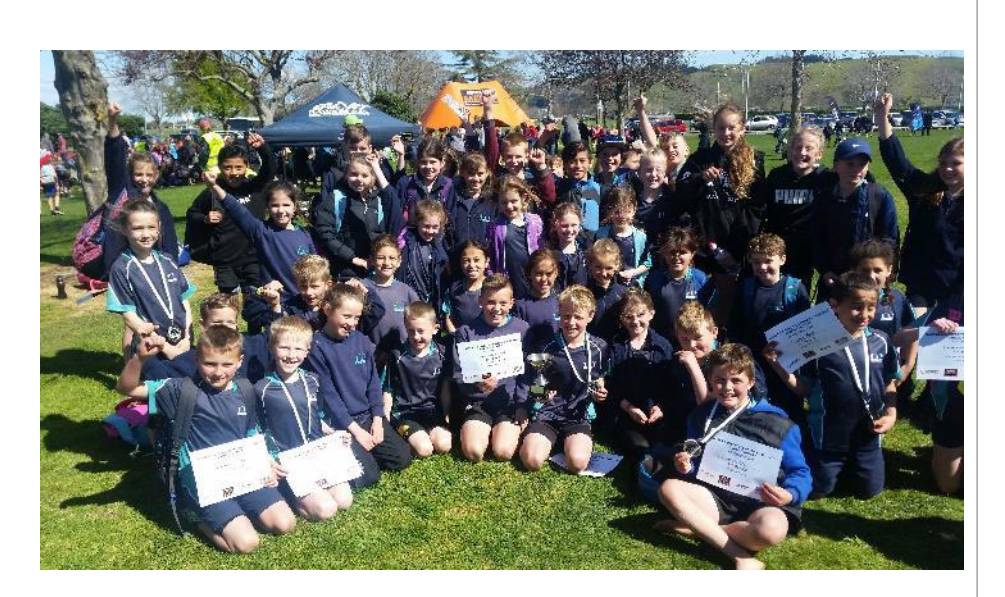
Pictured: The entire team of runners - all 48 who represented Greenmeadows School and took out the Napier champs!

Each of the runners who finished in the top 30 of the races on Tuesday are able to enter into the Hawkes Bay Cross-country champs